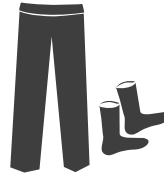
College Pants Worn with black socks