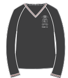
Year 12 Jumper