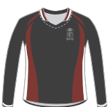
College Long Sleeved Sports Top