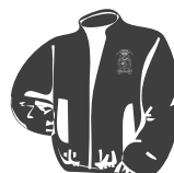
College Sports Spray Jacket