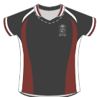
College Polo Top