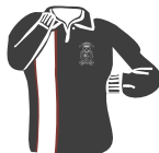
College Rugby Top