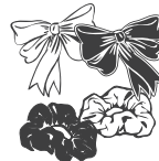
Black or White Ribbons/Scrunchies