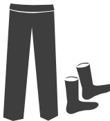
College Pants Worn with black socks