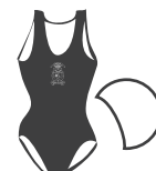
College Bathers/Cap Worn for GSV swimming/diving