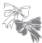
Ribbons Black or White