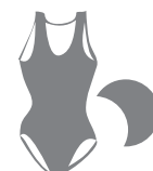
College Swimsuit/Cap Worn for interschool swimming