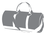
College Sports Bag

Please note that additional sports uniform items will be required for certain GSV sports such as netball, athletics, swimming and basketball. Further information about this will be provided by Sports staff.