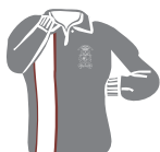
College Rugby Top