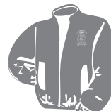
College Sports Spray Jacket