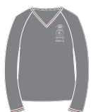
Year 12 Jumper