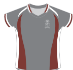
College Polo Top